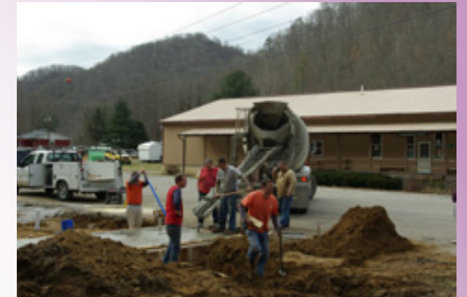
Construction begins on kiosk

Hundreds of hours invested by Red Bird Mission Community Outreach and Maintenance staff in this project were funded by general donations to the Mission. Thank you to so many for making clean water a priority for the area.